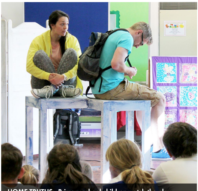
HOME TRUTHS: Primary school children watch the play

The project was also to encourage civilian pupils to appreciate the challenges faced by the children of our Armed Forces when they are posted. In addition, it encouraged schools to reflect on their policies and procedures for dealing with pupil mobility.